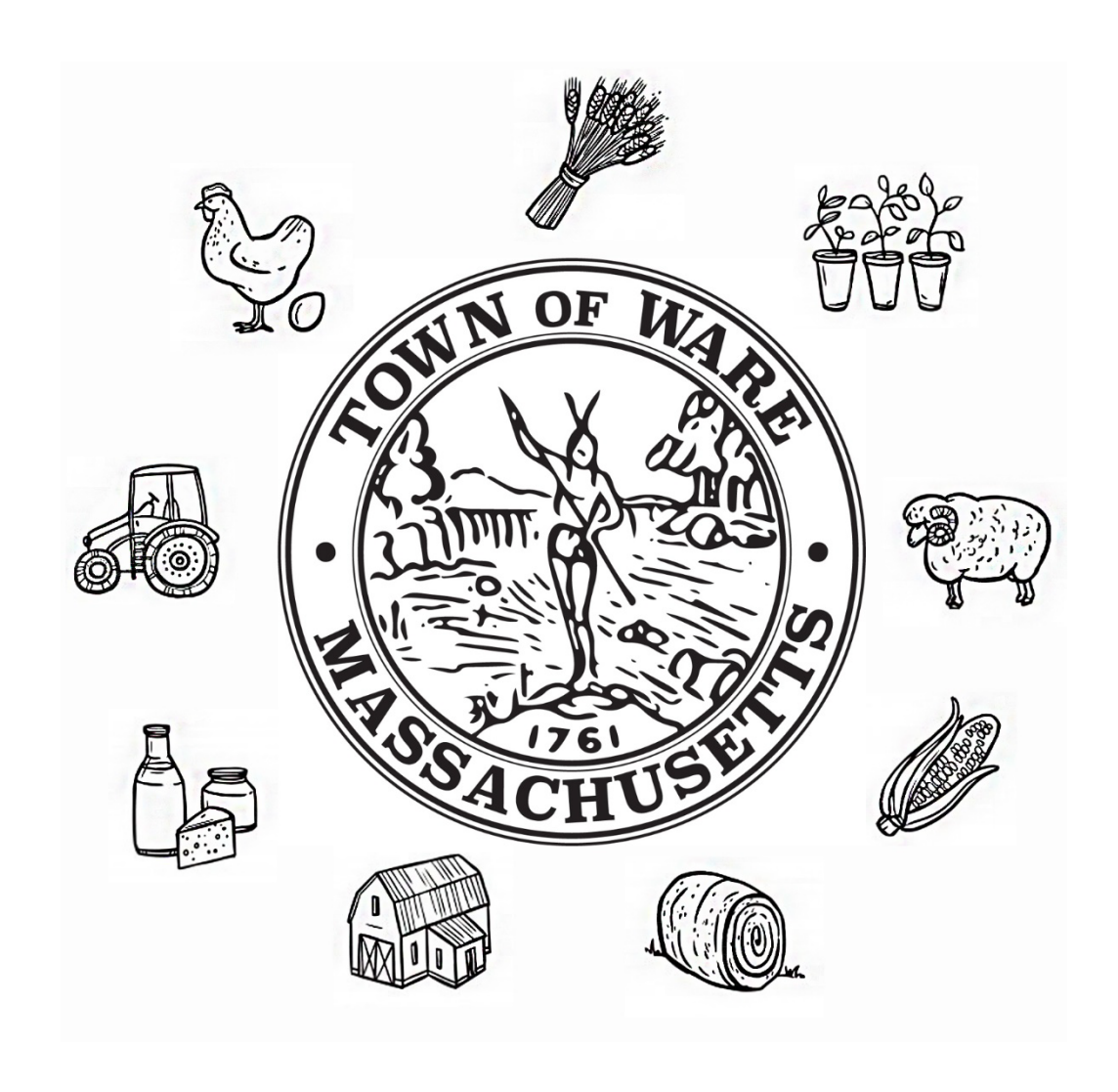
RIGHT TO FARM BYLAW